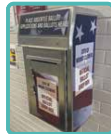
City Hall (outside) 1 Crocker Boulevard Open 24 hours