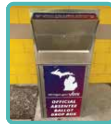
Cairns Community Center 58 Orchard Street Open 24 hours