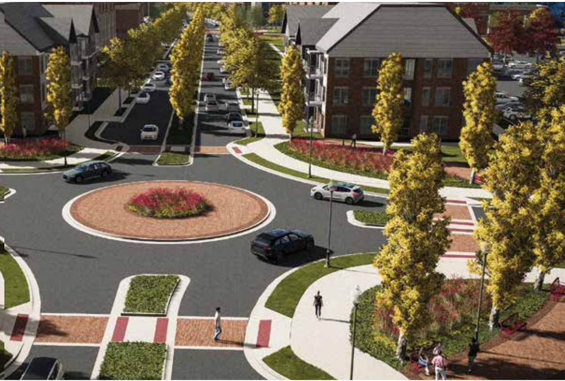
Conceptual renderings of the future Broughton Road extension and boulevard. (Not an official plan).

an adjacent multi-use pathway. We anticipate construction to begin this spring.