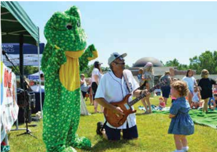
Macomb Township has more children per household than any other municipality in the County.