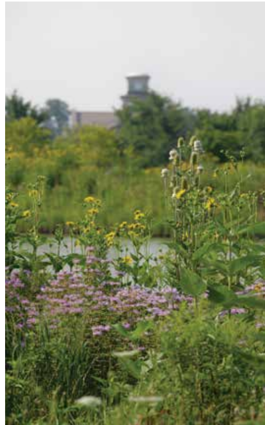
A native Midwest prairie is being established around the McBride Pathway located on Broughton Road near 25 Mile.

Looking ahead to 2026, the Township remains focused on ensuring that every project enhances your quality of life for our community.