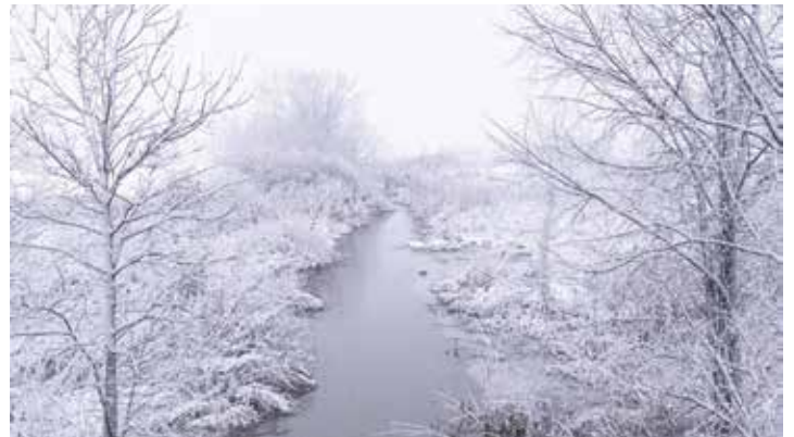
First place winner of the 2024 Winter Photo Contest

All experience levels are welcome to participate and share their favorite winter moments. For contest rules, submission guidelines and prize details, visit www.macombtwp.org/photocontest . Questions can be sent to photos@macomb-mi.gov . Grab your camera and bundle up! We can't wait to see winter through your eyes.